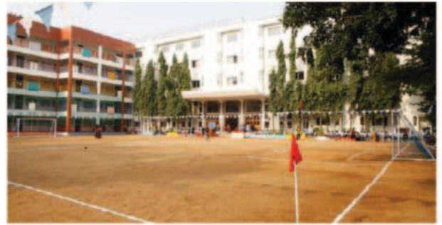
National Academy for Learning (NAFL)