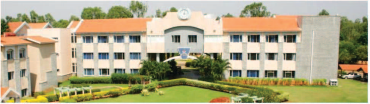
The International School, Bangalore (TISB)