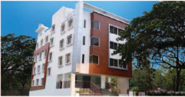
NPS Global Montessori Center