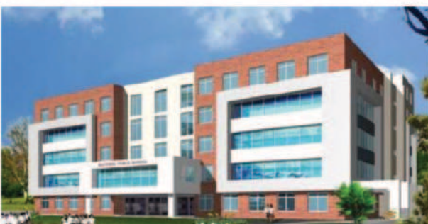
NPS HSR Layout