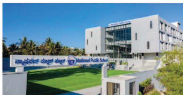
NPS JP Nagar