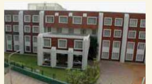
National Public School, Koramangala