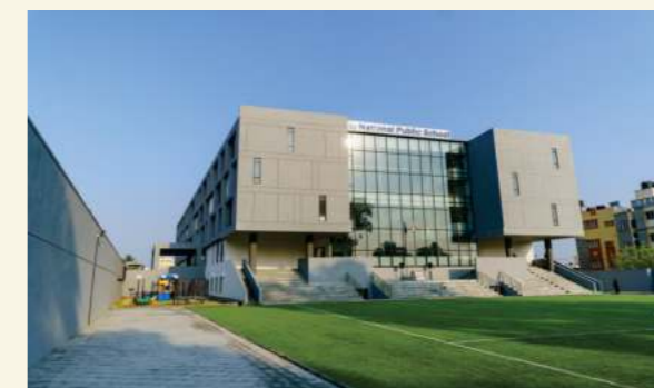
National Public School, JP Nagar, Bangalore