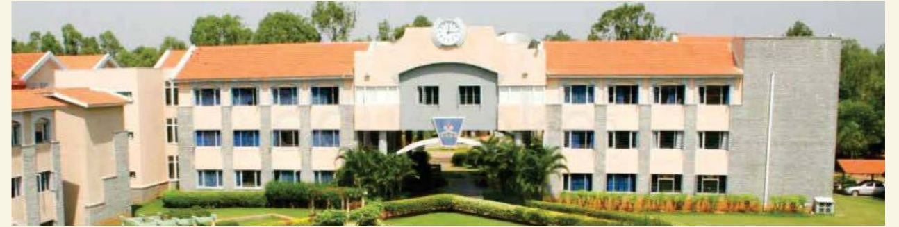
The International School, Bangalore (TISB)