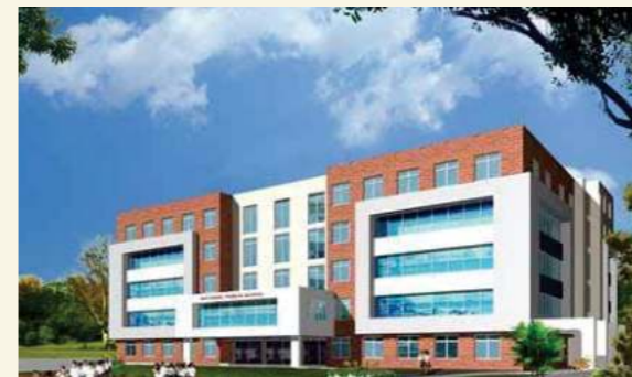
NPS, HSR Layout, Bangalore