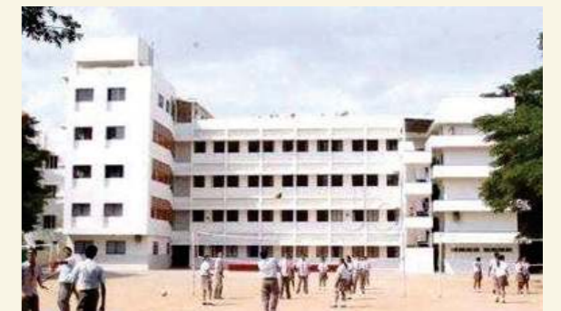
National Public School, Indiranagar