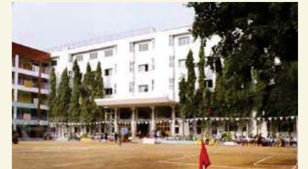
National Academy for learning (NAFL)