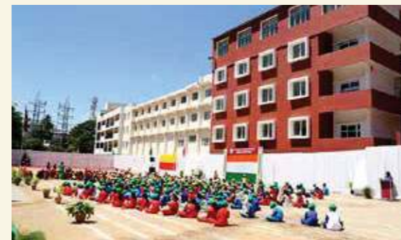
National Public School, Rajajinagar