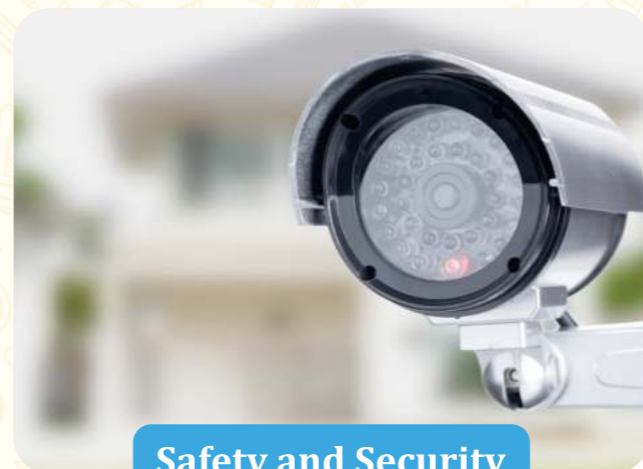
Safety and Security