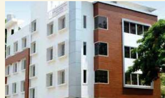
NPS Global Montessori Center